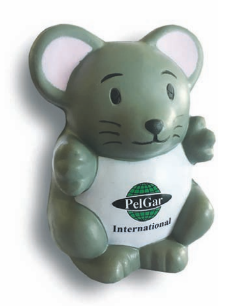
Above: Maurice the mouse - PelGar's PestEx giveaway. Right: The re-styled PelGar stand at PestEx 2017.

PestEx 2017, the UK's premier pest control event was held at the end of March at London's Excel Centre. PelGar took up prime position (opposite the ever popular coffee lounge) for the BPCA's bi-annual event. With record visitor numbers and the biggest show to date, what was it that encouraged visitors to the PelGar stand?