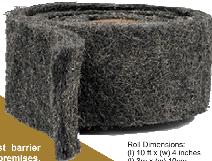
Roll Dimensions: (l) 10 ft x (w) 4 inches (l) 3m x (w) 10cm

Roban Blocker is a good rodent and pest barrier designed to provide protection for your premises. Made from coarse stainless steel interwoven with durable synthetic fibers, it forms a highly effective physical barrier to keep pests out.