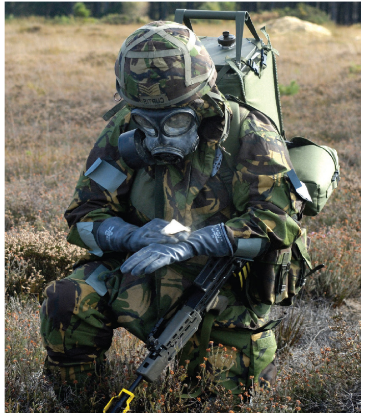
Kits contain clear easy to understand instructions